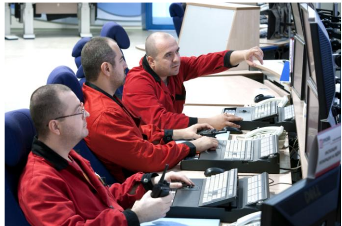
From the field to the control room, Honeywell wireless technology allows you to seamlessly extend your process control network into the field.

Honeywell OneWireless Wireless Device Manager (WDM) manages all wireless field devices, including ISA100 Wireless field instruments and network infrastructure devices, such as access points.