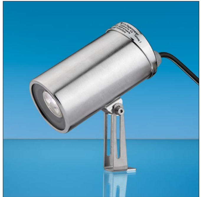
Lumistar luminaire USL 15-LED with hinged bracket