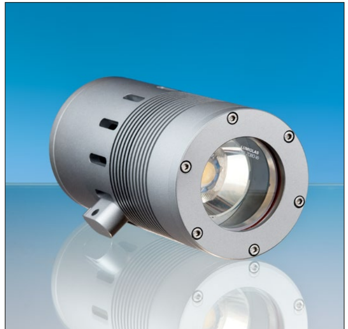
Lumistar luminaire ASL 57-LED

Luminaires for sight glasses on circular fittings and visual flow indicators are mounted on the mating flange using the hinged bracket. With the screw-type sight glass fitting similar to DIN 11851, the luminaire is fastened with a flange collar or direct on the slotted nut.