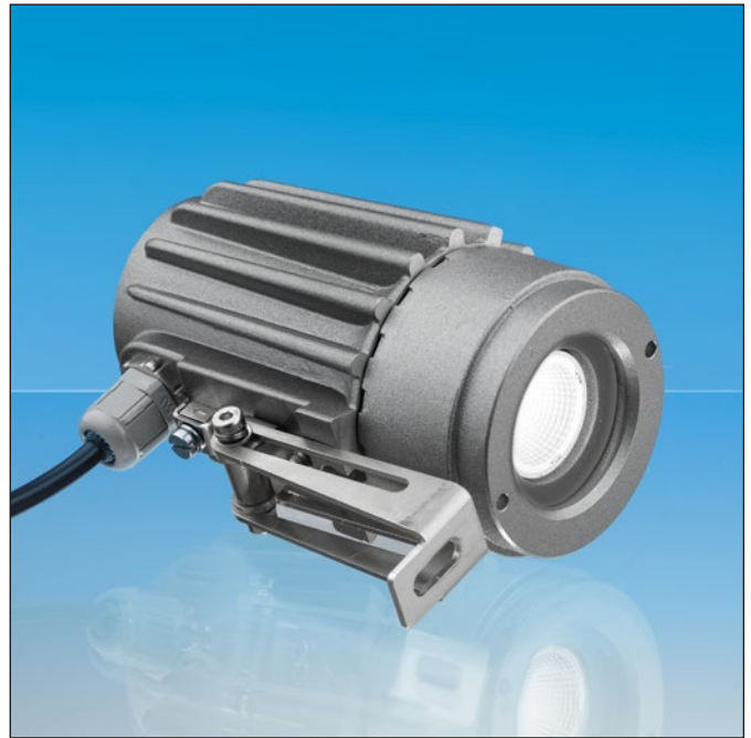
Lumistar luminaire USL 05-LED