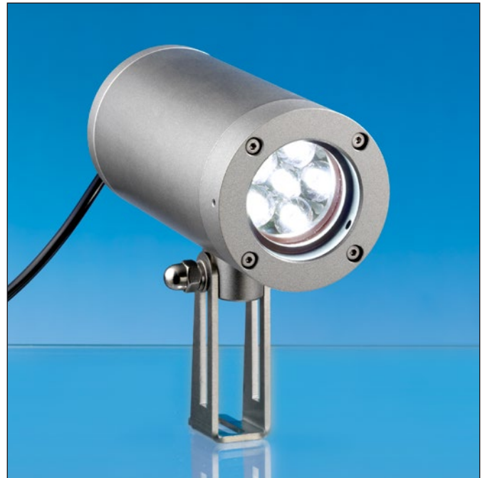
Lumistar luminaire ASL55LED-Ex