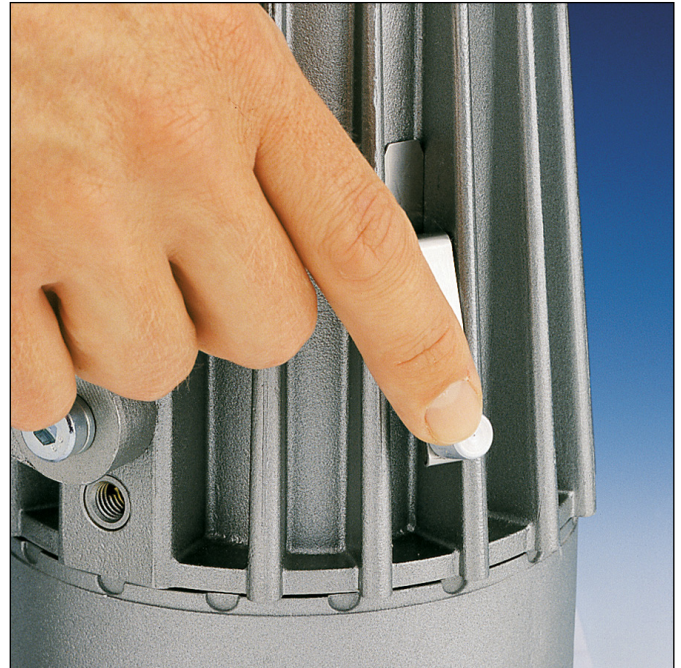
Lumistar timer as optional feature for Ex- and Non Ex-Lumistar luminaires