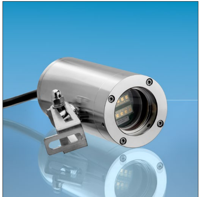
Lumiglas signalling device M55-BD-Ex