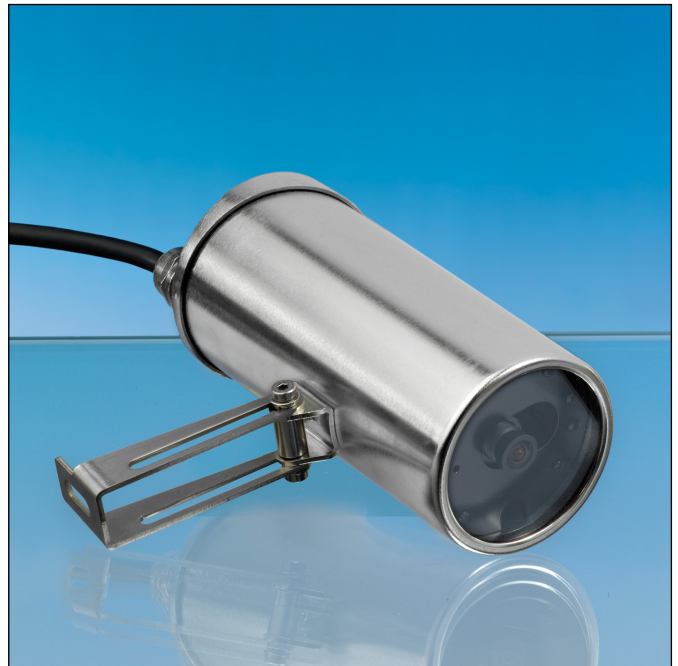
VISULEX camera K15-P-D with fixed lens