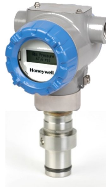
Figure 1 – STG73P Flush Mount Gauge Pressure Transmitters feature field-proven piezoresistive sensor technology